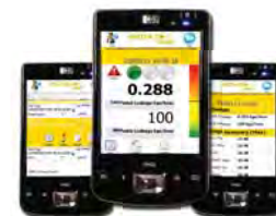
Midas Meter ® Windows Mobile PDA Software

Midas Meter ® takes you from reactive to proactive maintenance by engaging in condition based monitoring and "predictive" maintenance activities. Midas Meter ® valve leak detection equipment therefore helps focus budget expenditure and actions on valves where maximum benefits can be achieved.