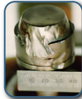
Eroded bypass valve

Score Group companies have employed acoustic emission technology to find leaking valves for oil & gas customers around the globe for the past 15 years. Midas Meter® employs Score developed signal processing & electronics, Score proprietary leakage algorithms and a Score proprietary Acoustic Emission sensor. Midas Meter® was developed and is manufactured by Score Group ISO 9001:2008 certified companies.